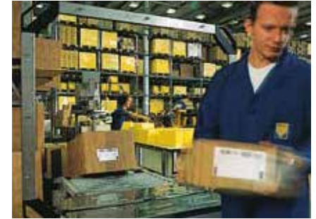
Manual Postal sorting